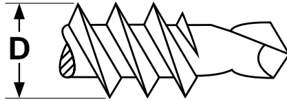
Fine Thread Drill Point Drywall Screw